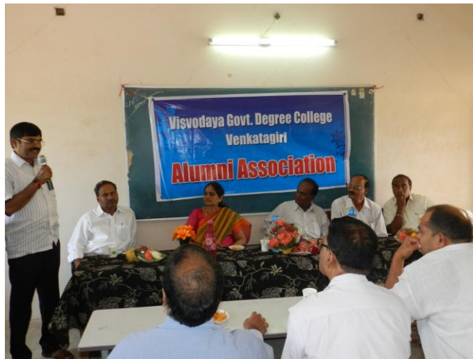
Alumni Association meeting held at college premises