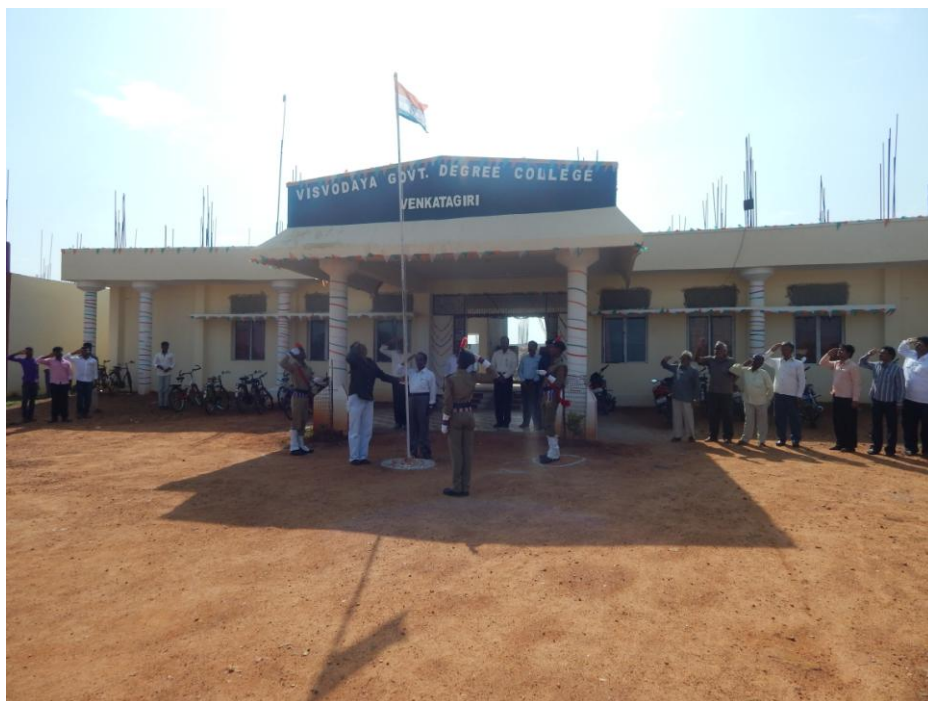
Independence Day Celebrations in the College