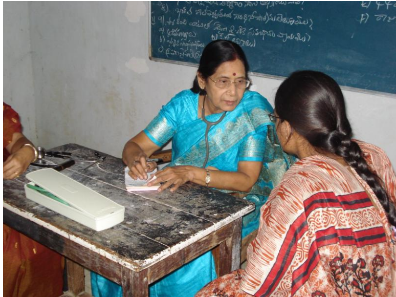
Medical check-up to the students