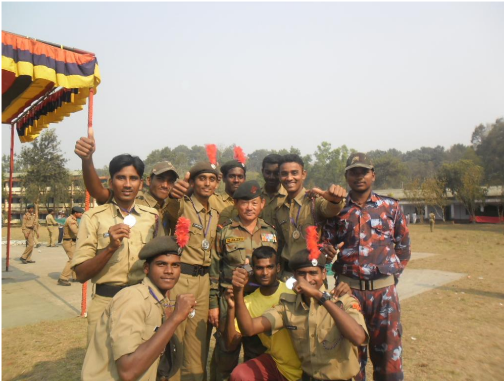
NCC College Unit cadets & Camp at NIC camp at Agarthala