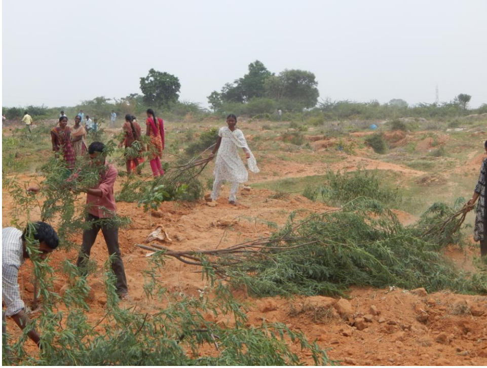
Campus Cleaning by the Students