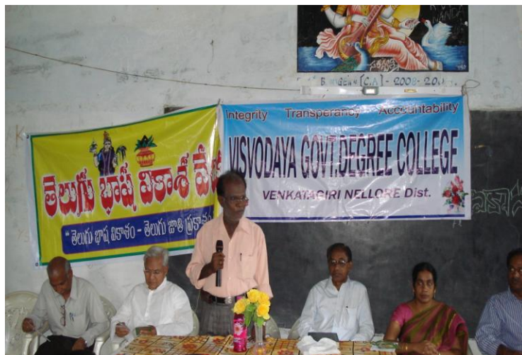
A programme on Telugu Literature Day