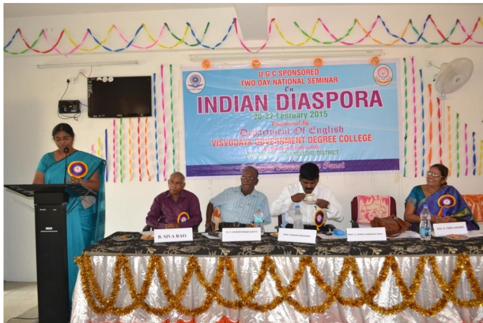
TWO DAY UGC NATIONAL SEMINAR ORGANISED BY THE DEPARTMENT OF ENGLISH ON 26 TH & 27 TH FEBRUARY 2015