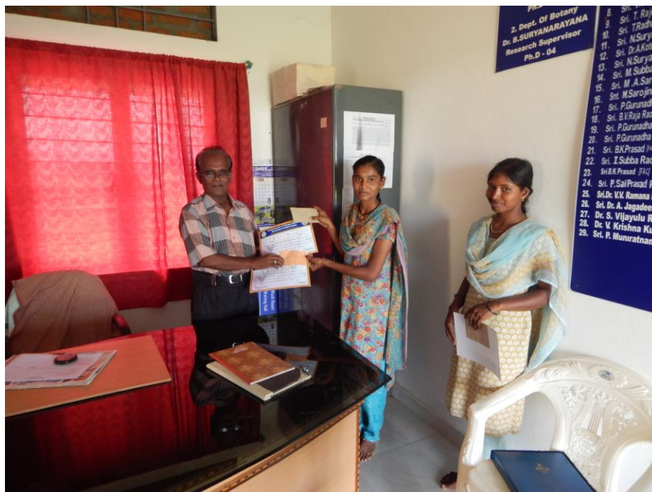
Awarding of Merit Scholarship to the University Topper by the Principal