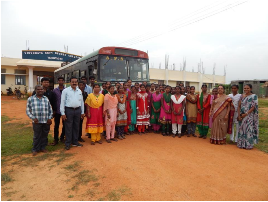
Dept. of Botany and Zoology Field Trip