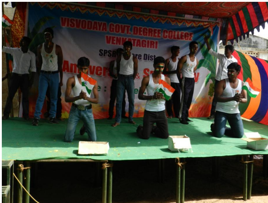
College Day celebrations