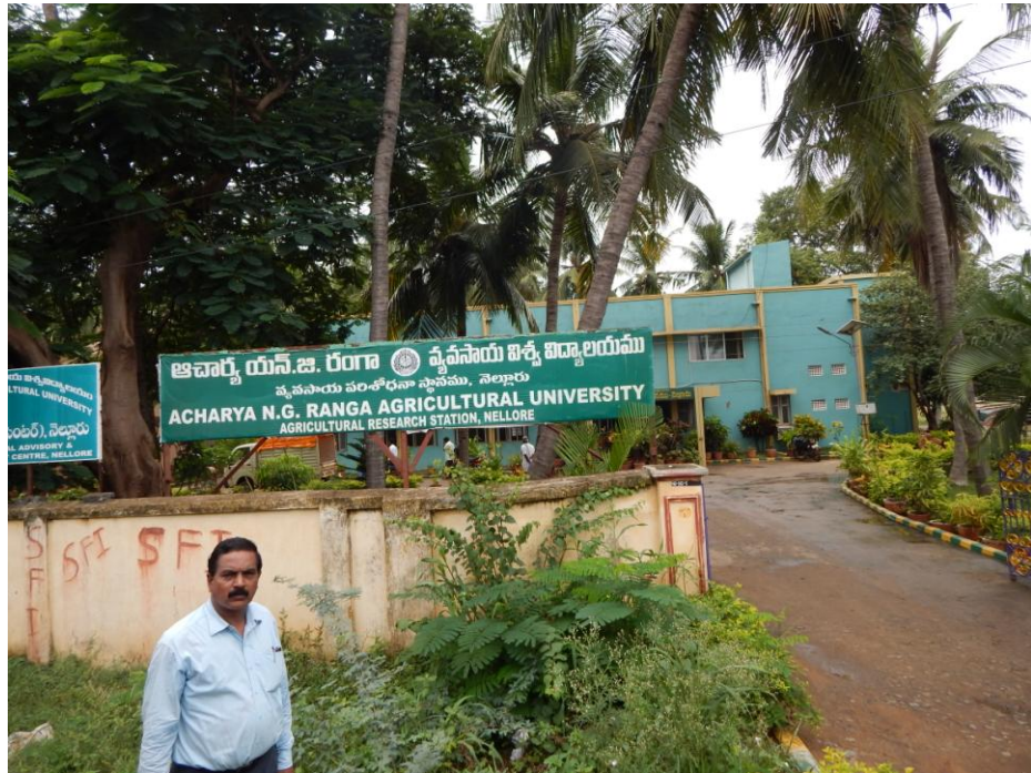
Dept. of Botany and Zoology Field Trip