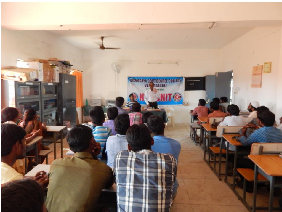
Awareness programme to NSS Volunteers