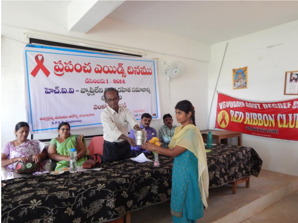
Prize distribution to the winner of Elocution competition on the occasion of AIDS Day