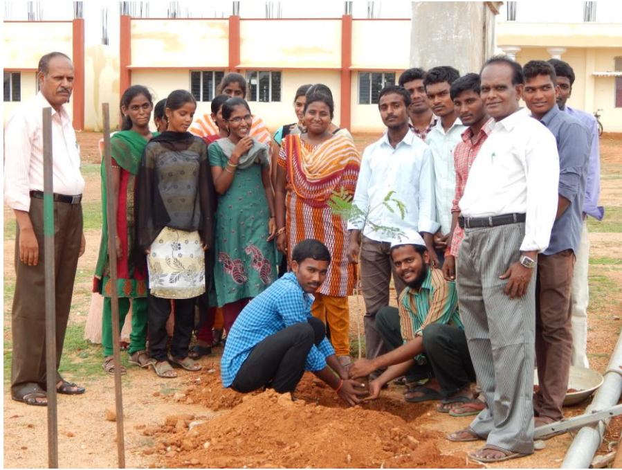
Plantation by NSS Students