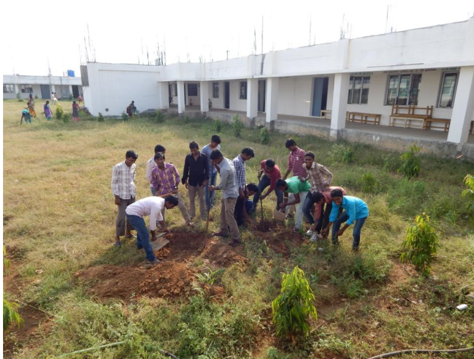
Swatch Bharat Programme in the college campus