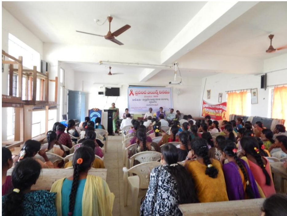
Awareness on the AIDs by the Govt. Medical Officer