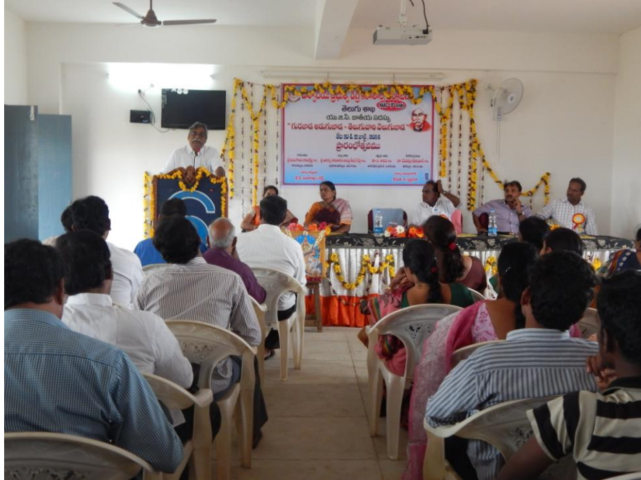
TWO DAY UGC NATIONAL SEMINAR ORGANISED BY THE DEPT. OF TELUGU ON 10 TH & 11 TH JULY 2014