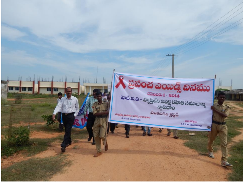
Rally on International AIDS Day