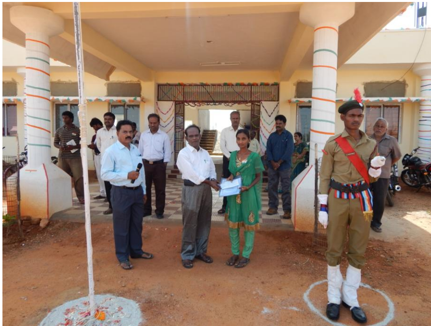
Awarding meritorious student on Independence Day