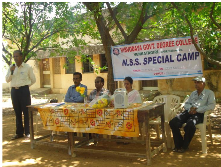
NSS Special camp organised in Empedu PHC