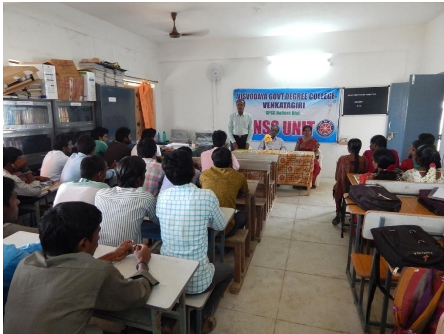
Awareness on the Voters Day by the NSS Unit