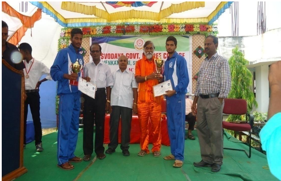
College Day celebrations