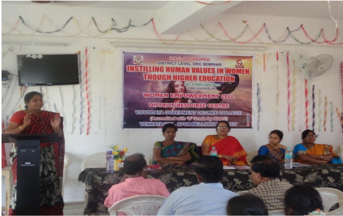
ONE DAY DISTRICT LEVEL DRC SEMINAR ORGANISED BY WOMEN EMPOWERMENT CELL AND DISTRICT RESOURCE CENTRE, VISVODAYA GOVT. DEGREE COLLEGE ON “INSTILLING HUMAN VALUES IN WOMEN THROUGH HIGHER EDUCATION” ON 10 TH FEBRUARY 2016.