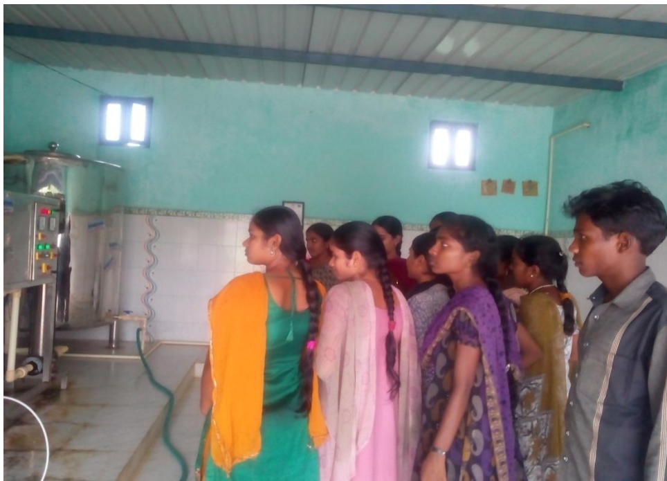
Dept. of Chemistry Field Trip