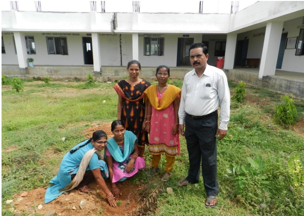
Medicinal Plants Plantation by Dept. of Botany