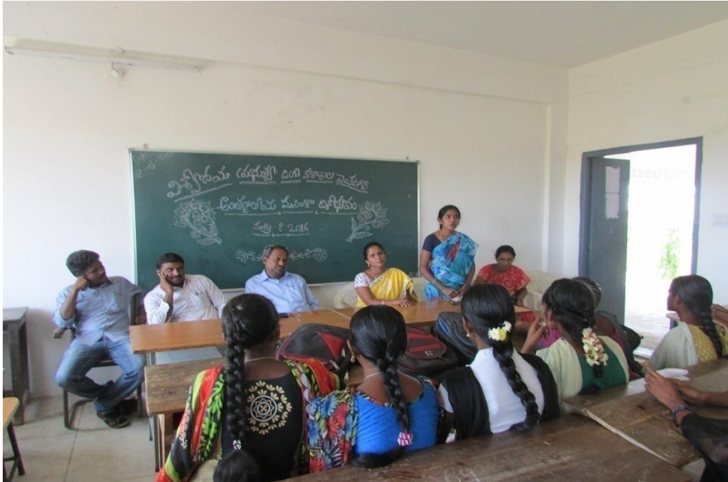
Celebrated "International Women's Day" on 8-3-2016