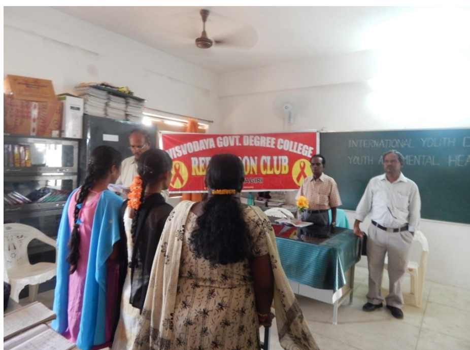
International Youth Day was celebrated on 12-01-2016