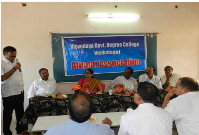
Alumni Association meeting held at college premises