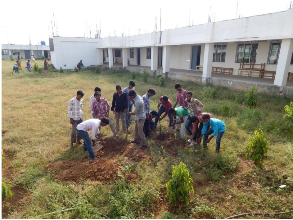
Swachh Bharat Programme in the college campus