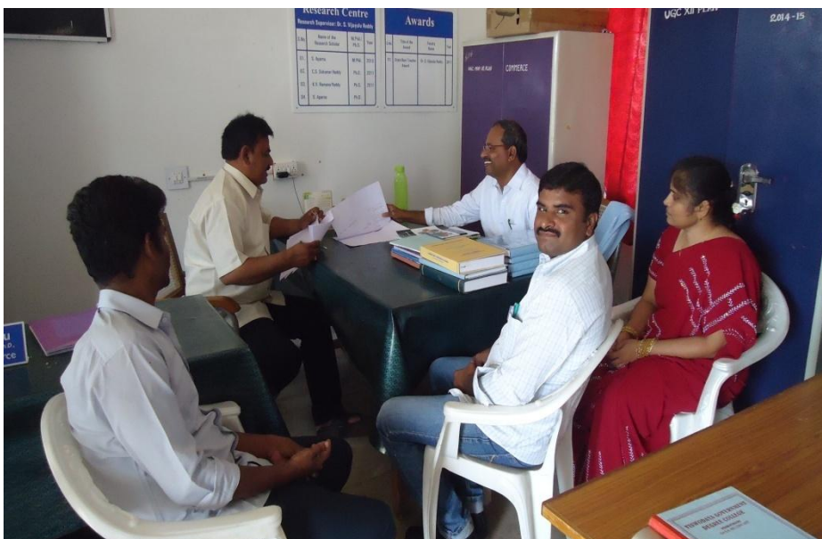
Academic Audit by the Academic Officer from Govt. of A.P.