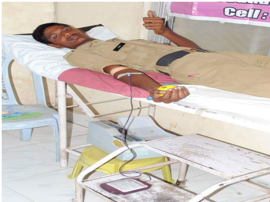
NCC College Unit cadets Blood Donation Camp on Blood Donor Day