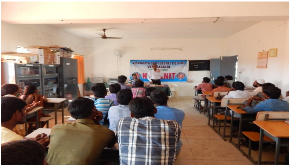
AWARENESS PROGRAMME TO NSS VOLUNTEERS