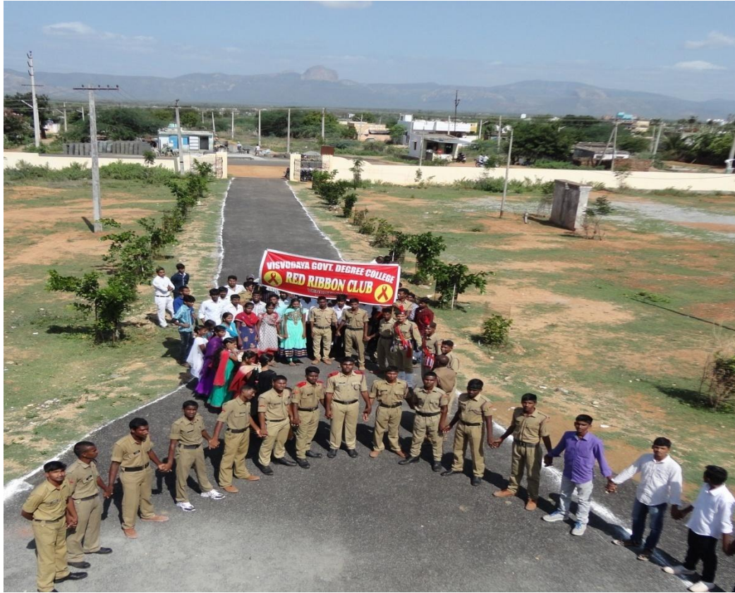
AIDS Awareness Rally was conducted on 01-12-2015 in Venkatagiri town on the occasion of World AIDS Day.