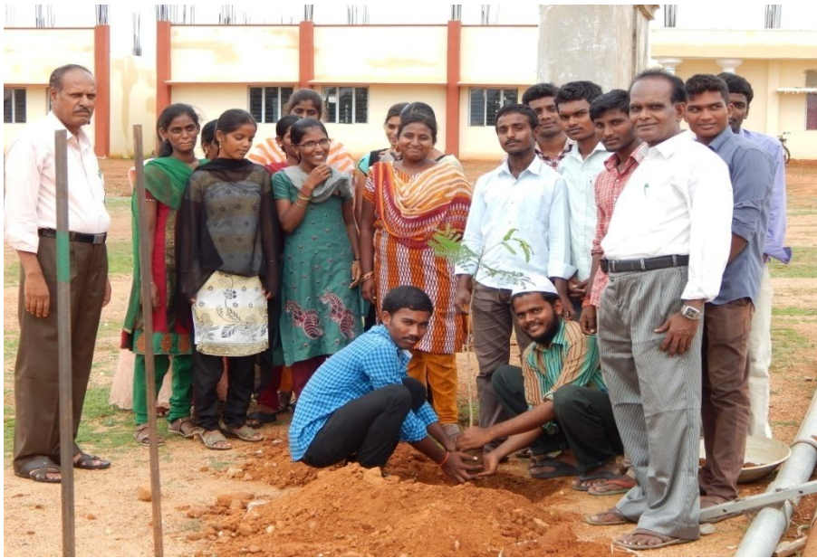
PLANTATION BY NSS STUDENTS