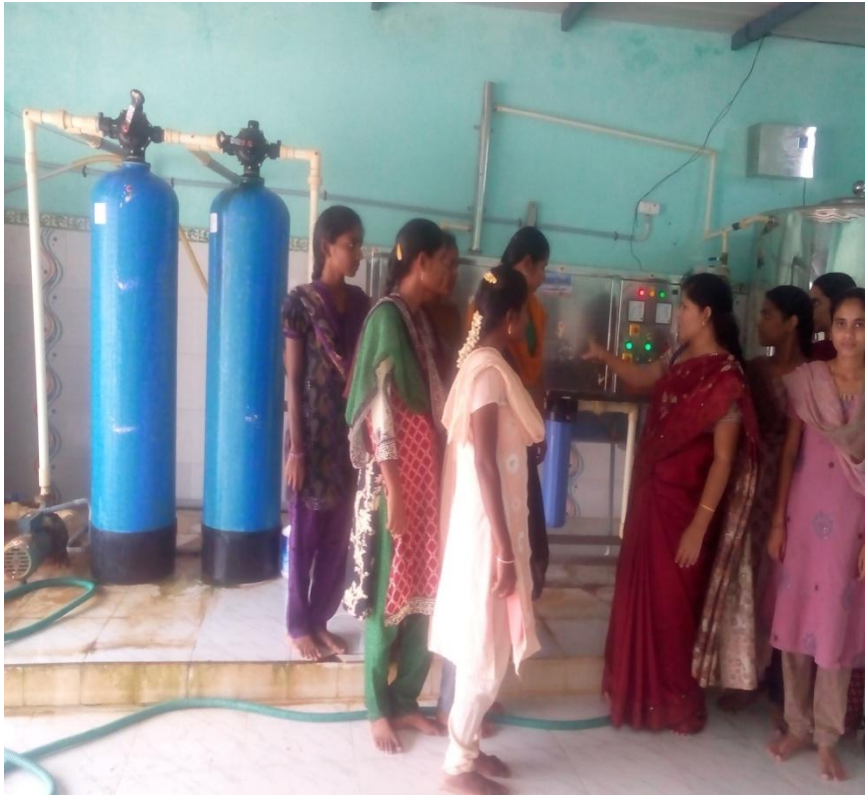
Dept. of Chemistry Field Trip