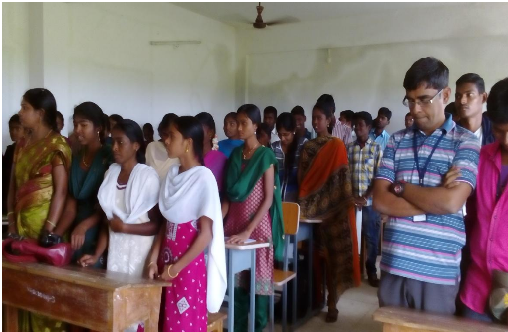
Dept. of Political Science Celebrated "Indian Constitutional Day "on 26-11-2015