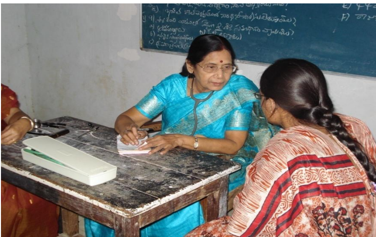
Medical check-up to the students