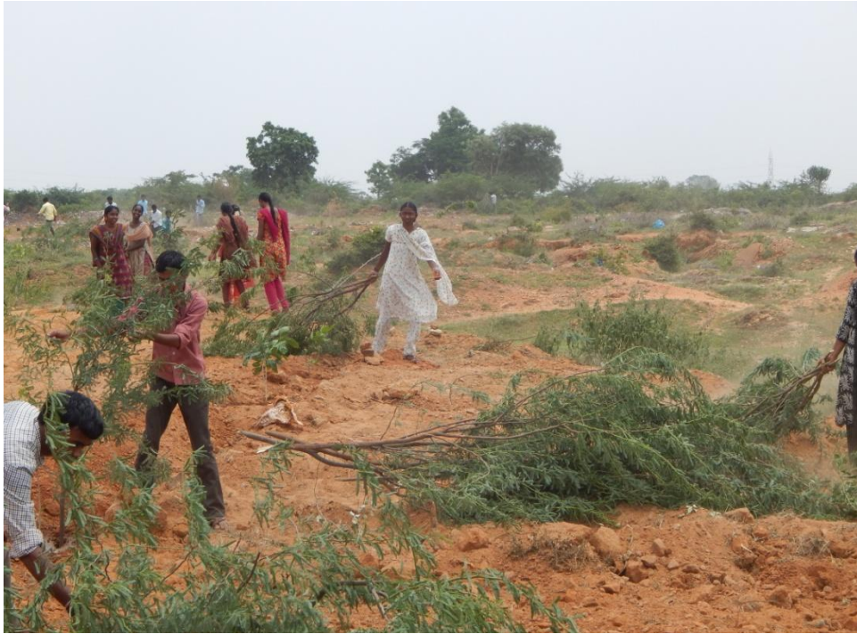
Campus Cleaning by the Students