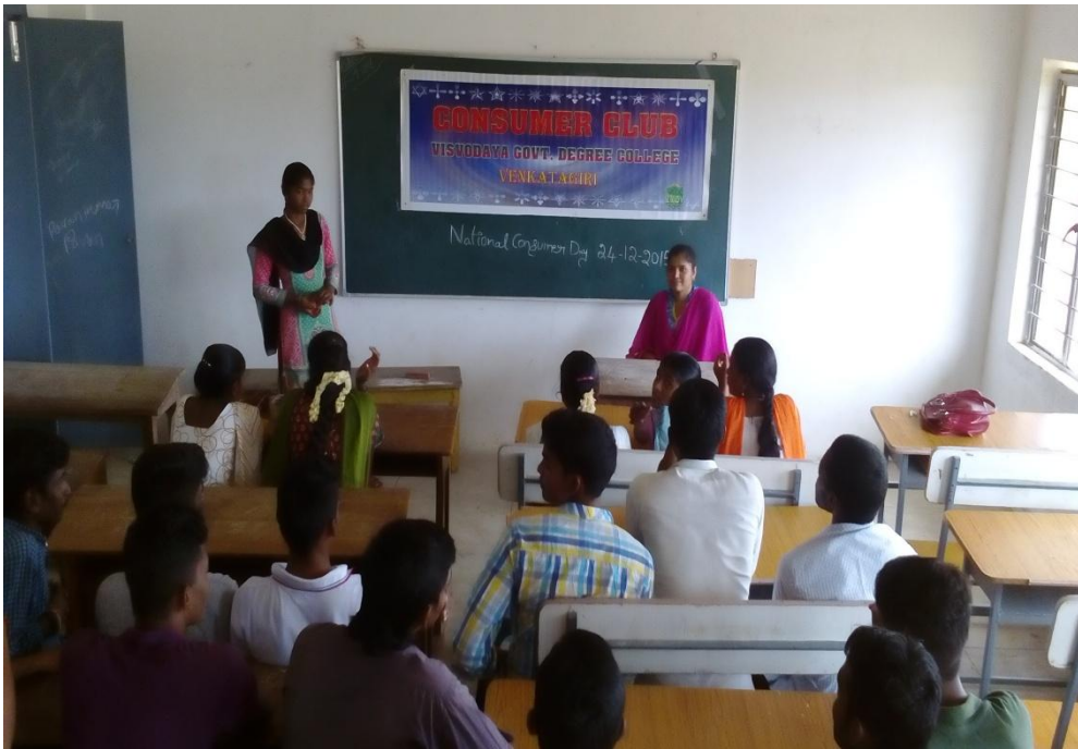
National Consumer Day was organised on 24-12-2015