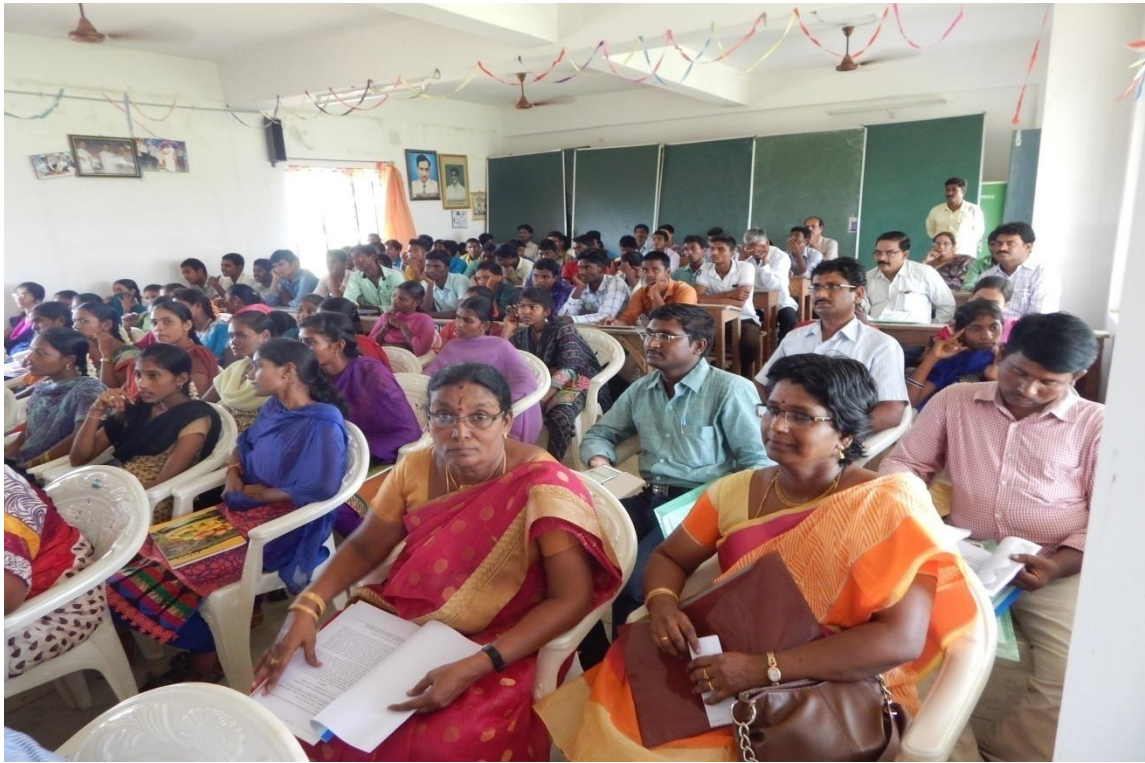
ONE DAY STATE LEVEL SEMINAR ORGANISED BY THE UGC-IQAC ON 23 rd SEPTEMBER 2015