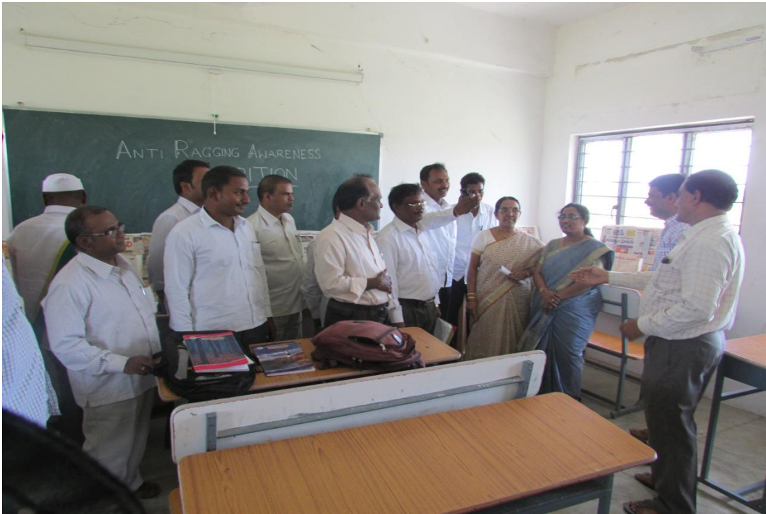
ANTI RAGGING AWARENESS PROGRAMME WAS ORGANISED ON 20-7-2015