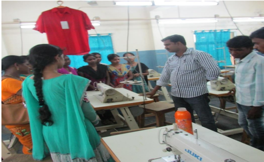
Field trip by Physics Department