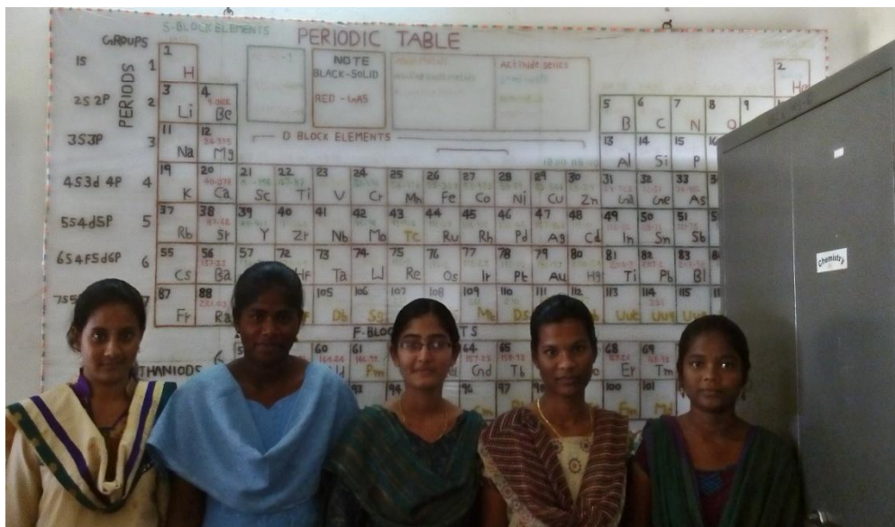
Celebration of Dimitrimendelev's 182 nd Birthday by Dept. of Chemistry