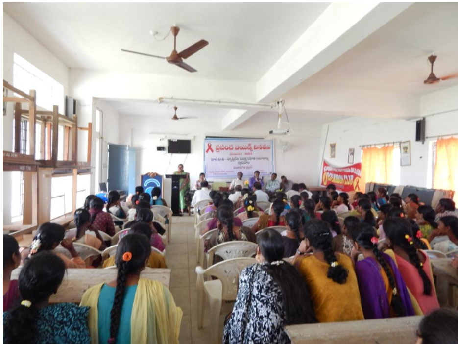
Awareness on the AIDs by the Govt. Medical Officer