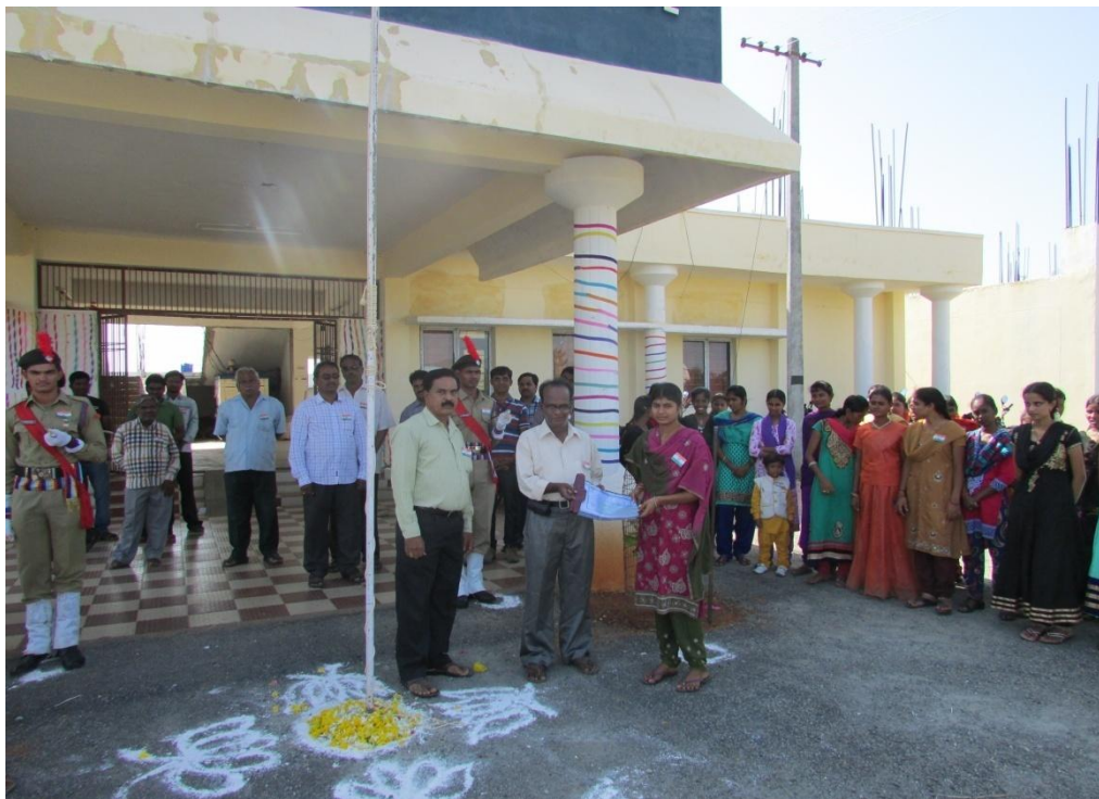
INDEPENDENCE DAY CELEBRATIONS IN THE COLLEGE