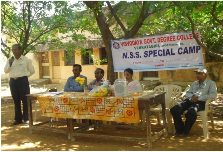
NSS Special camp organised in Empedu PHC