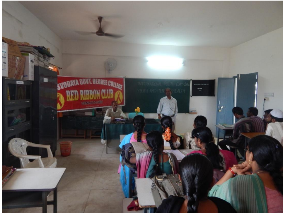
RED RIBBON CLUB AWARENESS TO THE STUDENTS